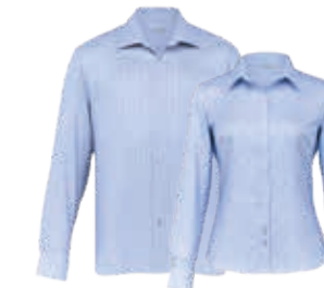
TNP, WTNP: BLUE/WHITE PAGE 36