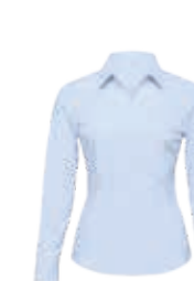
WTMO: EGGSHELL PAGE 66