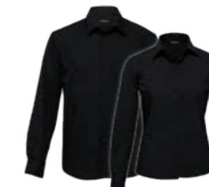
TRLS, WTRLS: BLACK PAGE 58