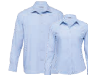
TBC, WTBC: SKY/WHITE PAGE 28