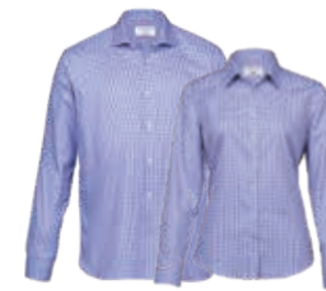
BSC, WBSC: NAVY/BLUE/WHITE PAGE 16