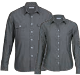
TMC, WMC: CHARCOAL PAGE 60