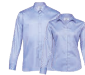
BCL, WBCL: FRENCH BLUE PAGE 10