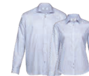
BLC, WBLC: WHITE/BLUE PAGE 12