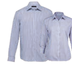
TF, WTF: WHITE/NAVY PAGE 30