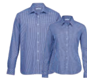
TKC, WTKC: NAVY/WHITE PAGE 24