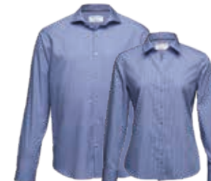
BFCs, WBFCS NAVY/WHITE PAGE 6