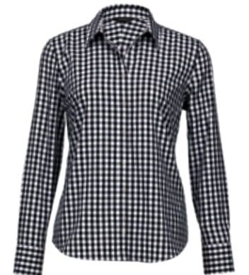
TAPERED FIT SHIRTS Slightly slimmer silhouette for a more tailored fit