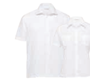
TL, WTL: WHITE PAGE 68