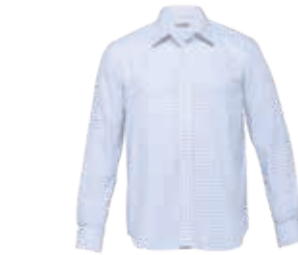
TAX: WHITE/MID BLUE PAGE 32