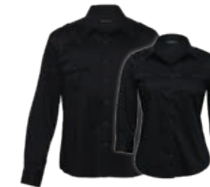
TPL, WTPL: BLACK PAGE 62