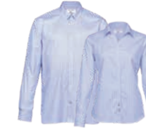
BHC, WBHC: SKY BLUE/WHITE PAGE 18