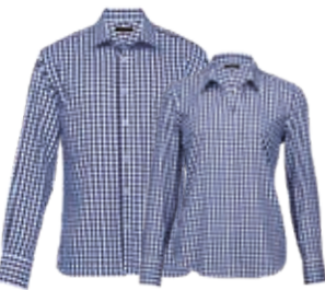
THC, WTHC: NAVY/WHITE PAGE 26