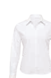
WTEL: WHITE PAGE 53