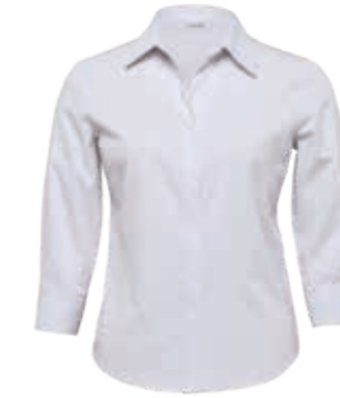
CLASSIC FIT SHIRTS Relaxed looser modern fit