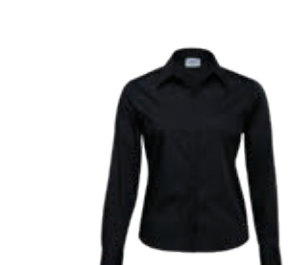
WTEL: BLACK PAGE 53