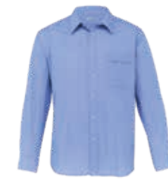
TTBL: BLUE/WHITE PAGE 44