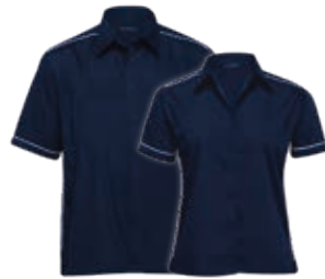
TMT, WMT: NAVY/WHITE PAGE 72

Our wide range of men's and women's woven shirts offer you a selection of his and her styles to create your working wardrobe. The Standard + Barkers offers coordinating colour pallets to create a cohesive, well tailored look for your business uniform.