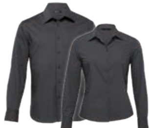
TRLs, WTRLs: CHARCOAL PAGE 58