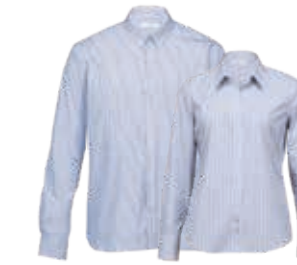
TCDH, WTCDH: WHITE/NAVY/BROWN PAGE 22