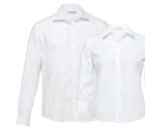
TE, WTE: WHITE PAGE 54