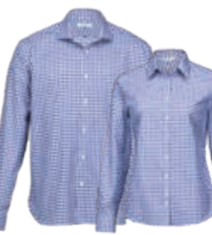
TIC, WTIC: FRENCH BLUE/WHITE PAGE 20