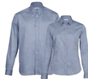
TBT, WBT: STEEL NAVY PAGE 34