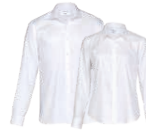
BOR, WBOR: WHITE PAGE 2