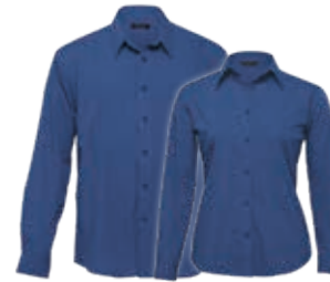
EOE, WEOE: FRENCH BLUE PAGE 40