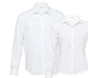
TRLS, WTRLS: WHITE PAGE 58