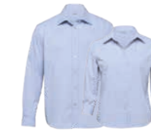
TU, WTU: BLUE/WHITE PAGE 42