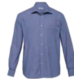
TSC: NAVY/WHITE PAGE 33