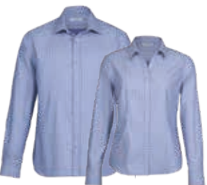
TFL, WFL: NAVY/WHITE PAGE 38