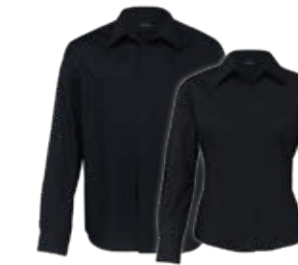
TV, WTV: BLACK PAGE 56