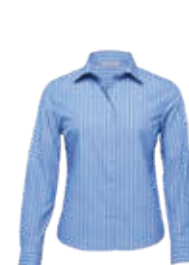
WES: BLUE/WHITE PAGE 48