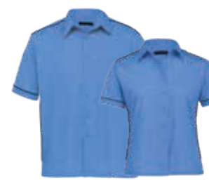
TMT, WMT: OCEAN/NAVY PAGE 72