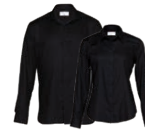
BTY, WBTY: BLACK PAGE 4