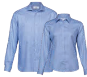
BQU, WBQU: COBALT BLUE PAGE 14