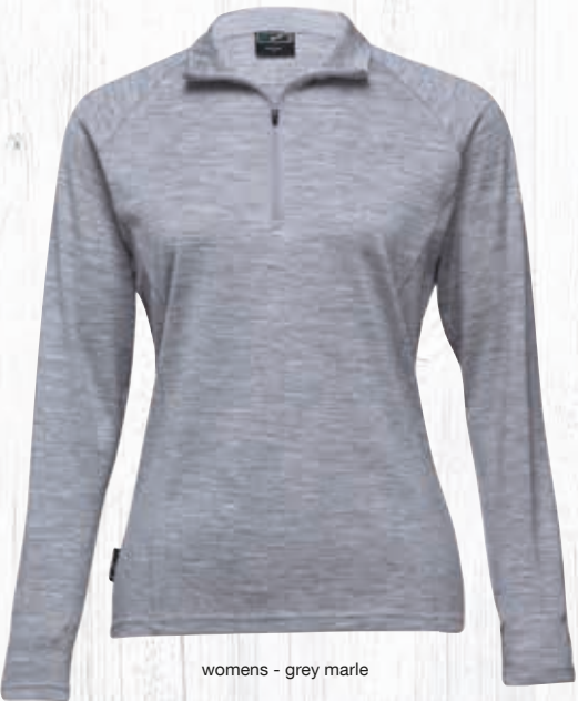
womens - grey marle