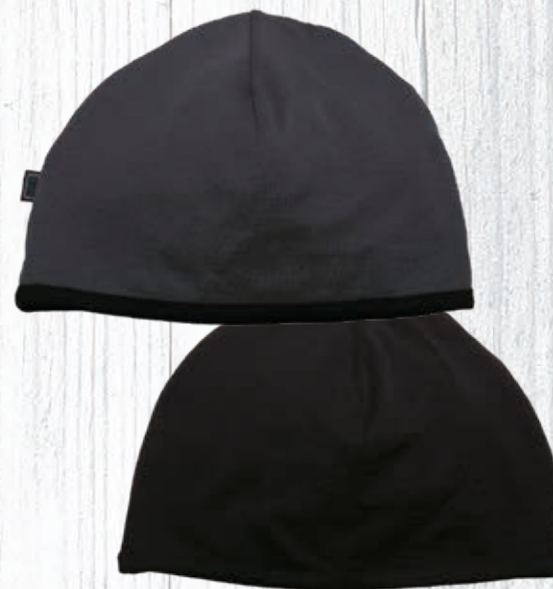
black (with charcoal inside)