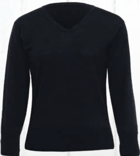
womens - black