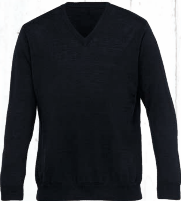
mens - black