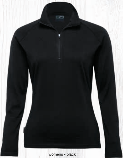
womens - black