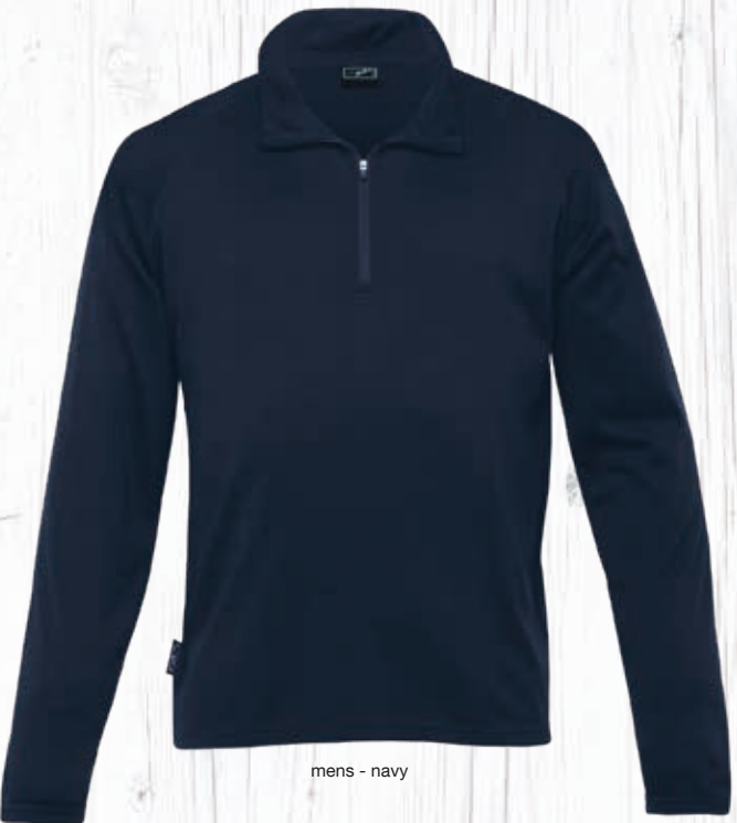
mens - navy