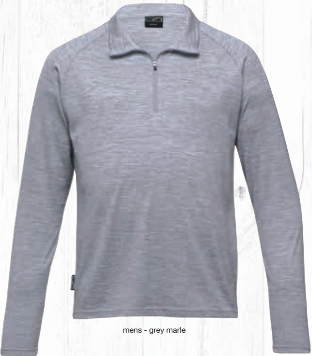
mens - grey marle