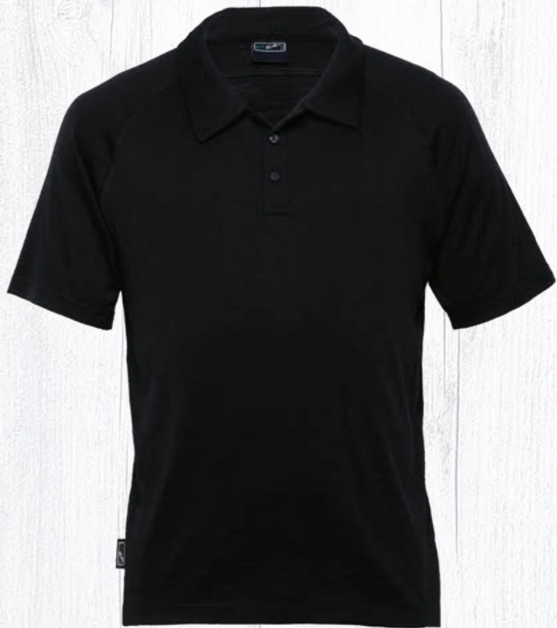
mens - black