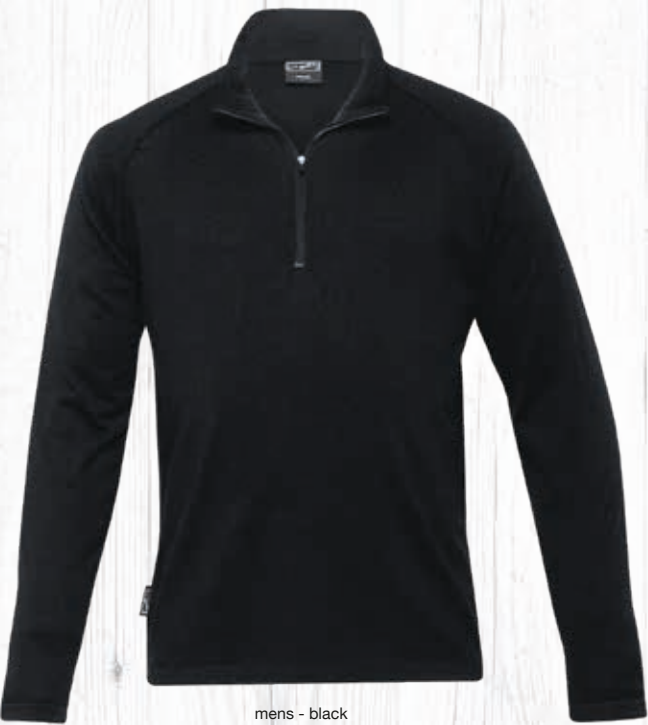
mens - black