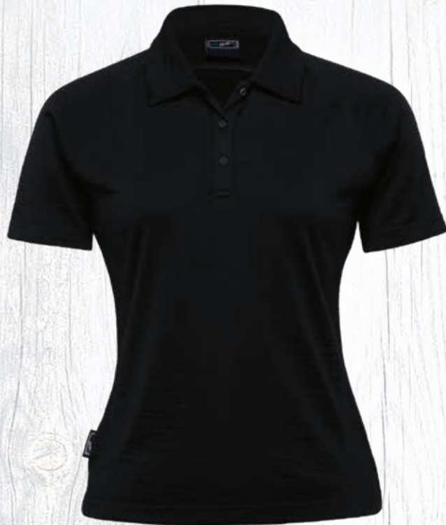
womens - black