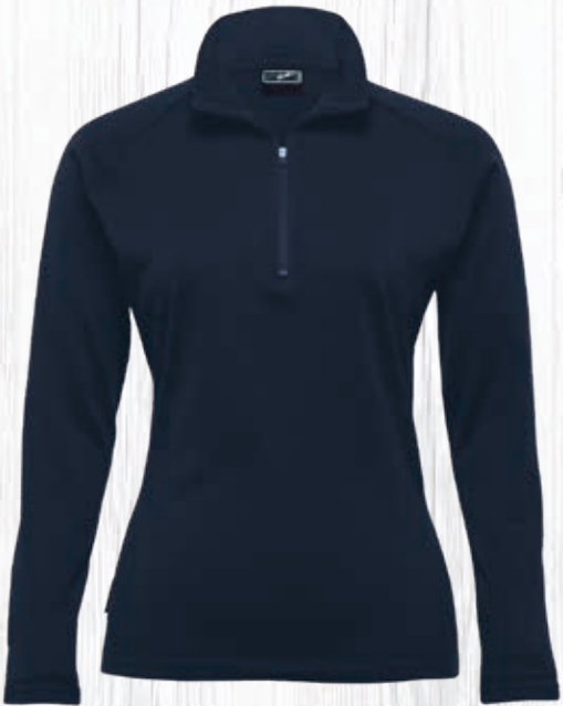
womens - navy