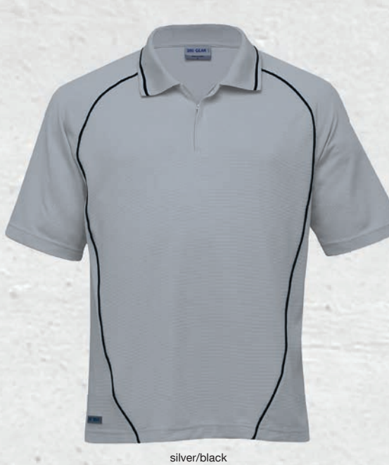
DRI GEAR PIPED OTTOMAN INSTINCT POLO (DGPO)

150gsm 100% micro poly ottoman | Moisture wicking | UV protection | Classic fit | Tipping detail on flat knit collar | Panel detailing with contrast piping | Concealed zipped plaquet with DRI GEAR puller | Raglan sleeve | DRI GEAR reflective badge on straight hem | Side splits at hem