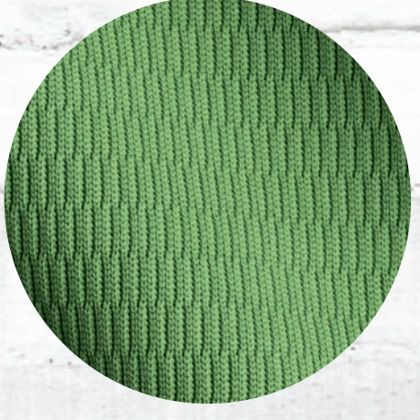
Dri Gear Tech Mesh 100% Micro poly 180gsm