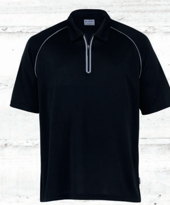
mens - black/aluminium