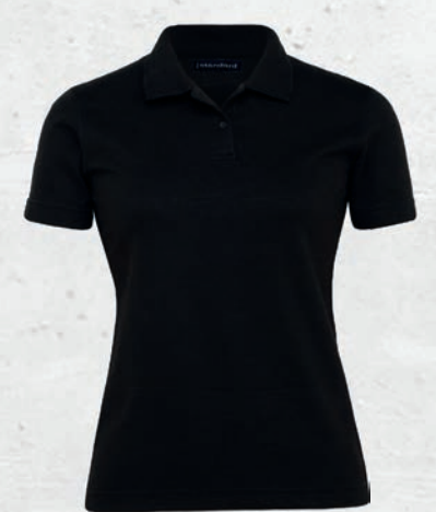
womens - black