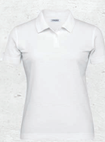
womens - white