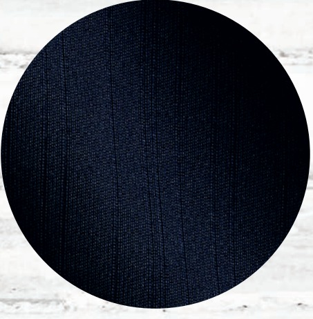
Dri Gear Needle Out 100% Micro poly 150gsm