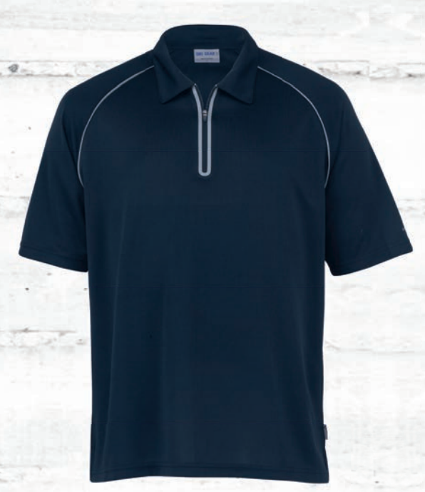
mens - navy/aluminium