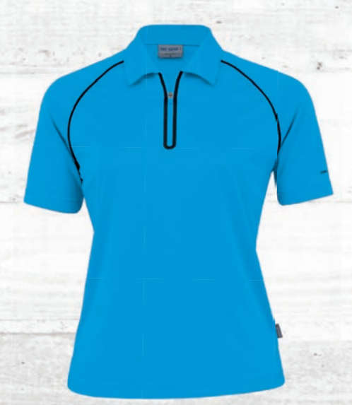
womens - cyber blue/black