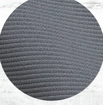
Dri Gear Ottoman 100% Micro poly 150gsm