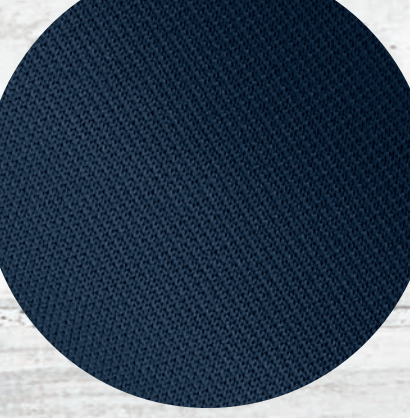
Dri Gear Plain Interlock 100% Micro poly 140gsm