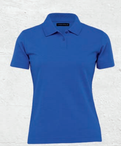
womens - royal