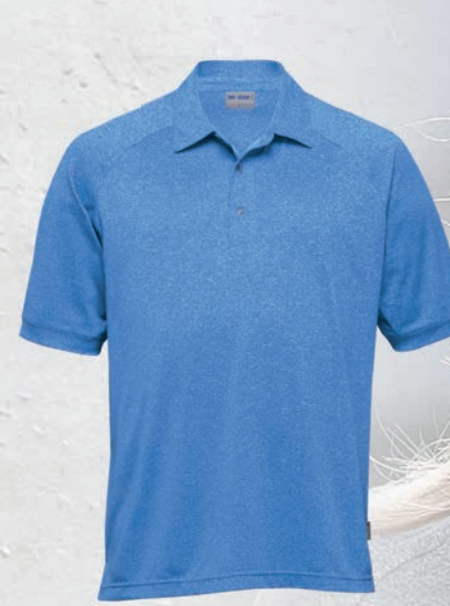
mens - royal melange