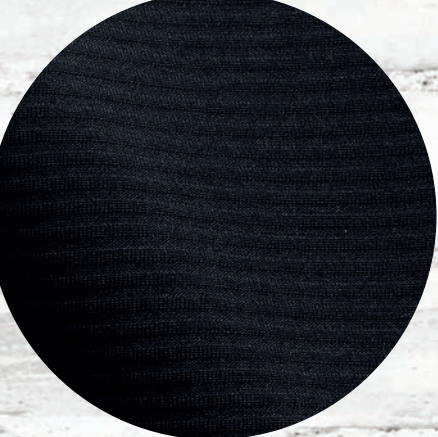
Dri Gear Mechanical Stretch Ottoman 96% Polyester 4% Elastane 180gsm