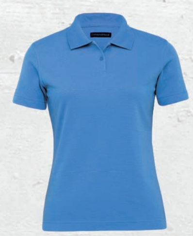
womens - ocean