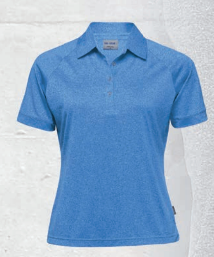
womens - royal melange