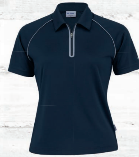
womens - navy/aluminium