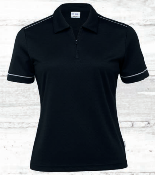
womens - black/aluminium