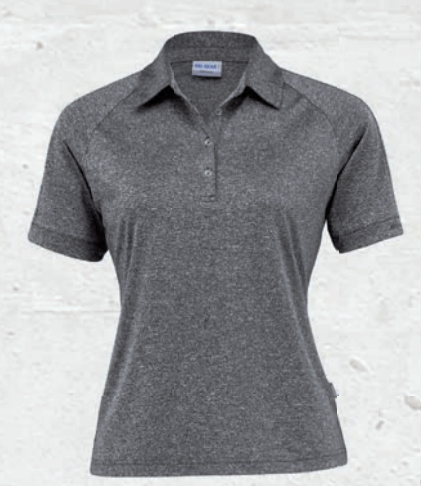
womens - graphite melange