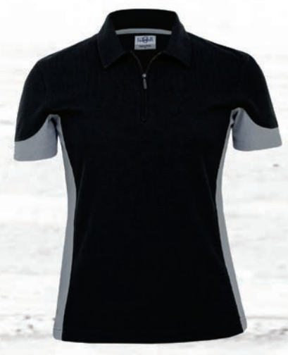
womens - black/aluminium