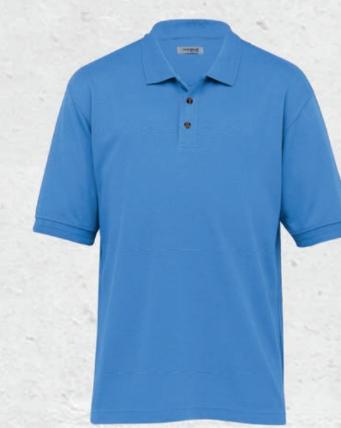
mens - ocean