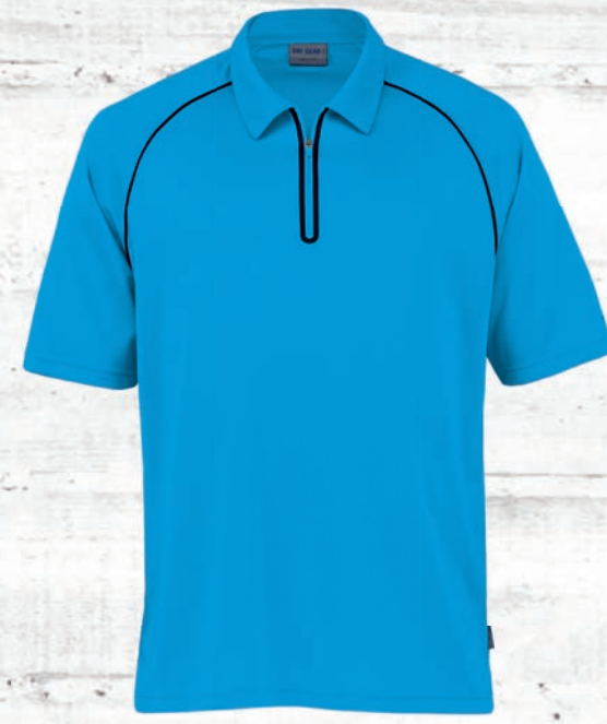
mens - cyber blue/black