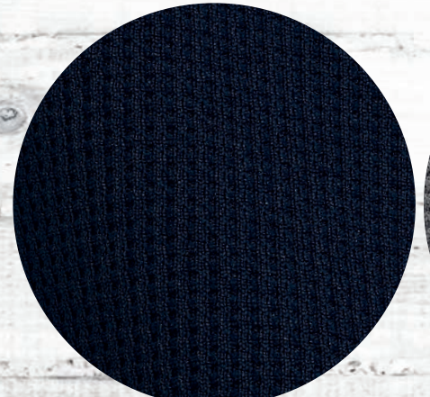
Dri Gear Waffle 100% Polyester 190gsm