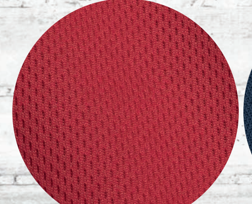
Dri Gear Eyelet Mesh 100% Micro poly 140gsm