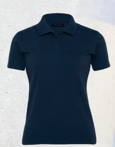
womens - navy