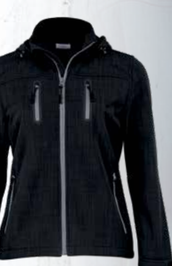
sizes XXS - XS slightly tapered fit for women